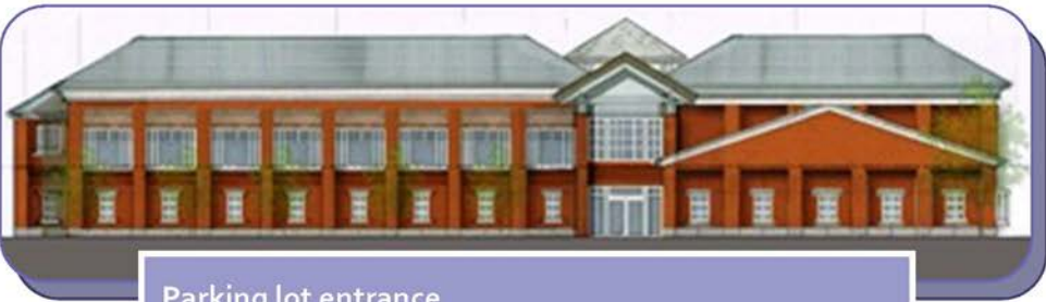
Parking lot entrance