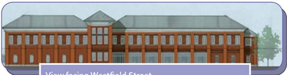
View facing Westfield Street

The new library will also incorporate many “green building” features in order to meet our environmental goals; which are to lower energy usage, decrease waste generation, decrease water usage, improve the use of natural and renewable resources, and lower overall harmful emissions in the products used in the construction and the operation of the building.